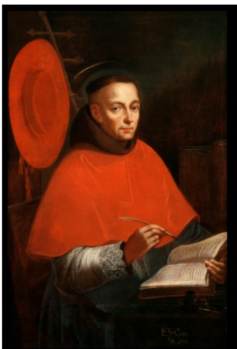
St. Bonaventure Fulda School of Painting

St. Bonaventure, Franciscan, theologian, doctor of the Church, was both learned and holy. Because of the spirit that filled him and his writings, he was at first called the Devout Doctor; but in more recent centuries he has been known as the Seraphic Doctor after the "Seraphic Father" Francis because of the truly Franciscan spirit he possessed.